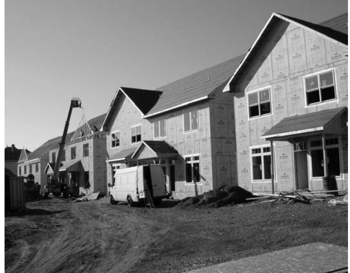
Victoria Ridge Under Construction (September 13 photo)

Rush Homes overcame many hurdles last year. We secured all the funding necessary for the $4.45 million project including Low Income Housing Tax Credit,