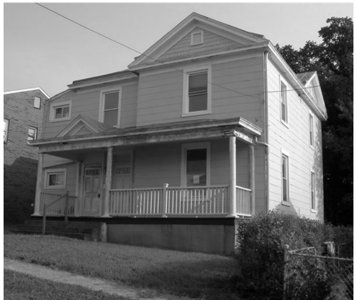
1608 Ruffner Place prior to the start of rehabilitation

ties that do not include mobility impairments are best tenant candidates. We anticipate great interest as the Ruffner apartments are spacious with one bedroom each, and the duplex is in a nice neighborhood, only two blocks from Riverview Avenue and the bus line.